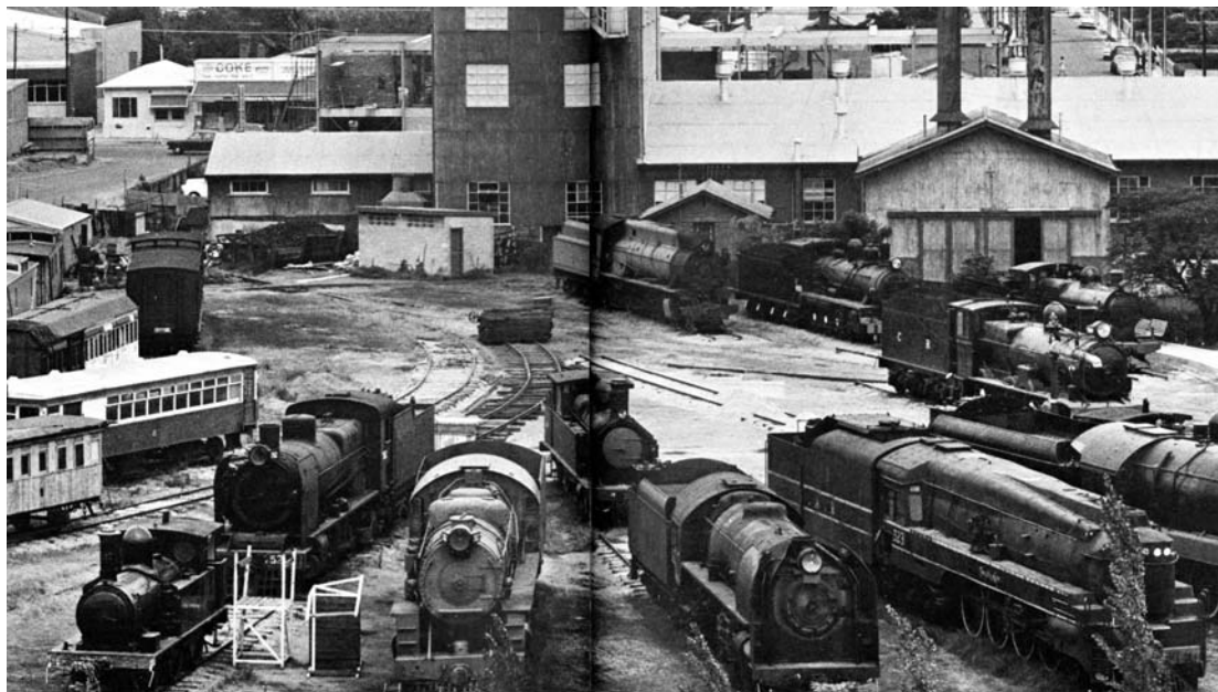
Initial lineup of locos at the museum (from above Guidebook)