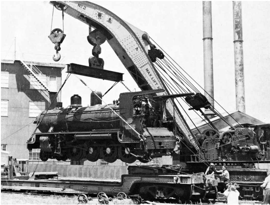
Unloading NM34 at the Depot

This page printed from SteamRanger Enthusiast website Copyright by publisher of the referenced publication or SteamRanger No commercial republication without reference to copyright holder R7012a